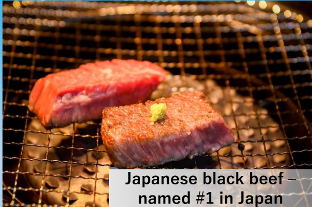
Japanese black beef – named #1 in Japan