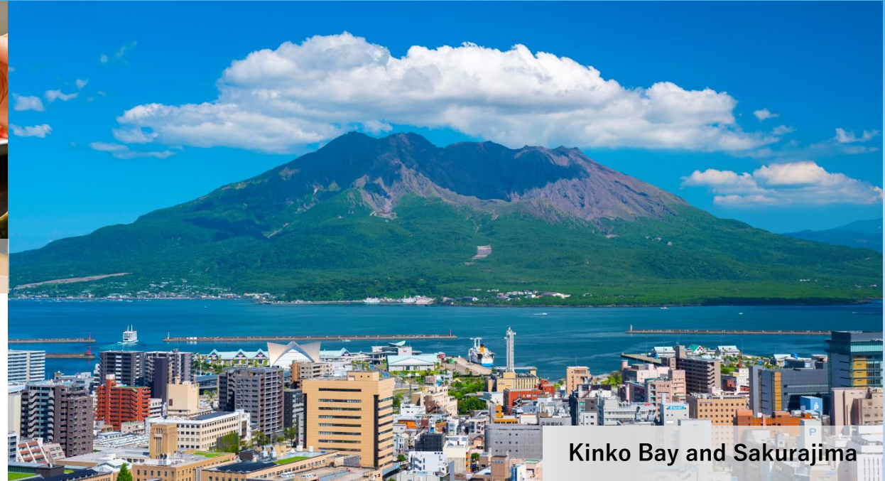
Kinko Bay and Sakurajima