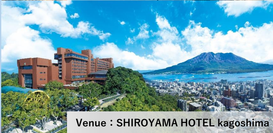
Venue : SHIROYAMA HOTEL kagoshima