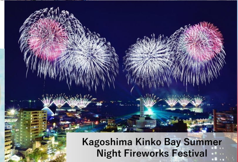
Kagoshima Kinko Bay Summer Night Fireworks Festival