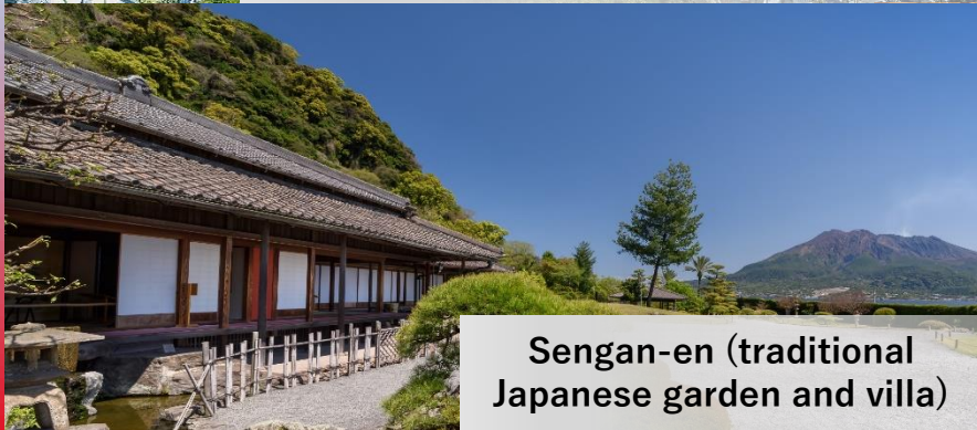
Sengan-en (traditional Japanese garden and villa)