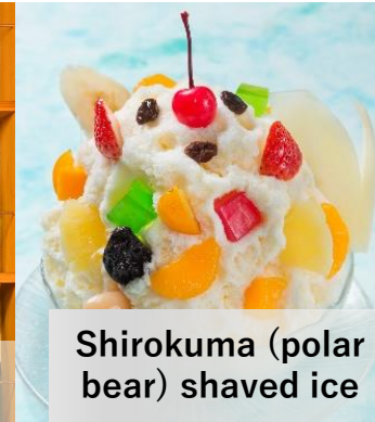
Shirokuma (polar bear) shaved ice