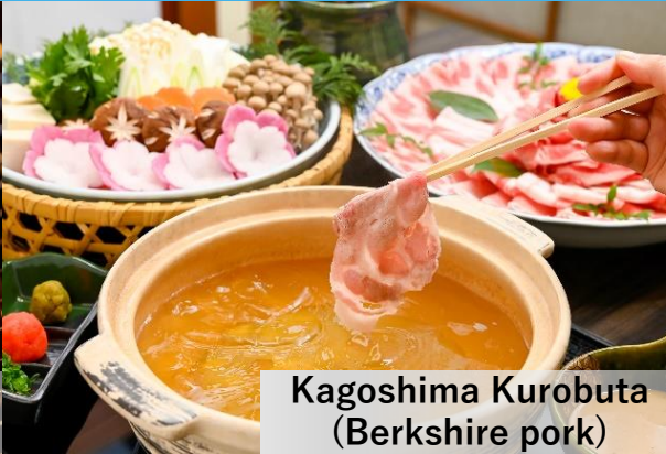
Kagoshima Kurobuta (Berkshire pork)