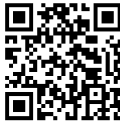
Kagoshima City Tourism Guide