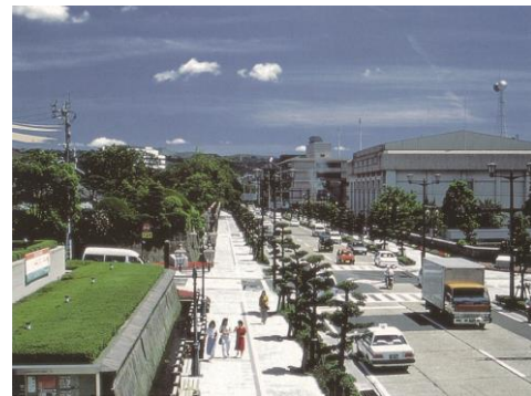
History and Culture Road