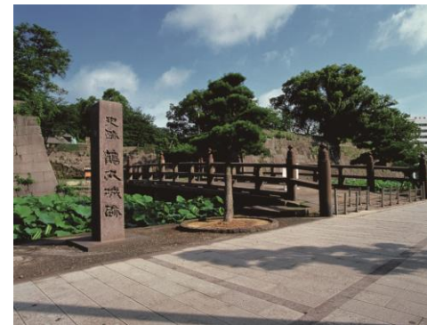
Kagoshima Castle (Tsurumaru Castle) Historical Landmark