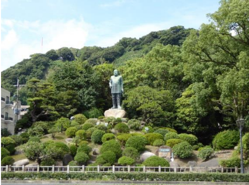
View from outlook point 2 (image)