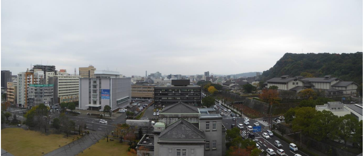
View from the sub outlook point

As a panoramic view of History and Culture Road Area can be seen from the outlook point in the corridor on the 6 th floor of the Kagoshima Prefectural Exchange Centre, it is determined to be a “sub outlook point” because it is within the facility.